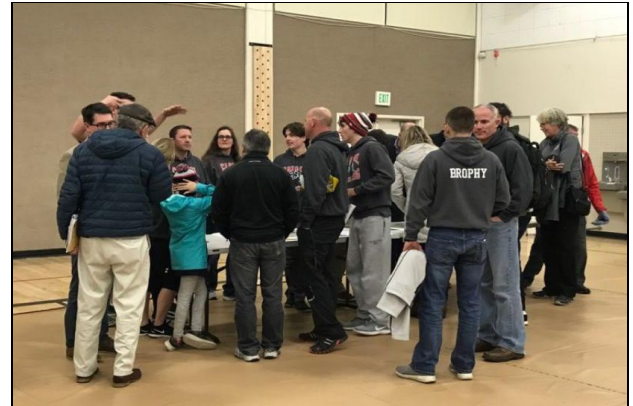
Attendees had the opportunity to review the diagrams up close and to note their comments and suggestions.

Here is a link to the presentation materials.